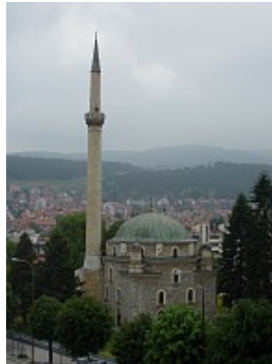
Hussein Pasha Mosque Pljevlja